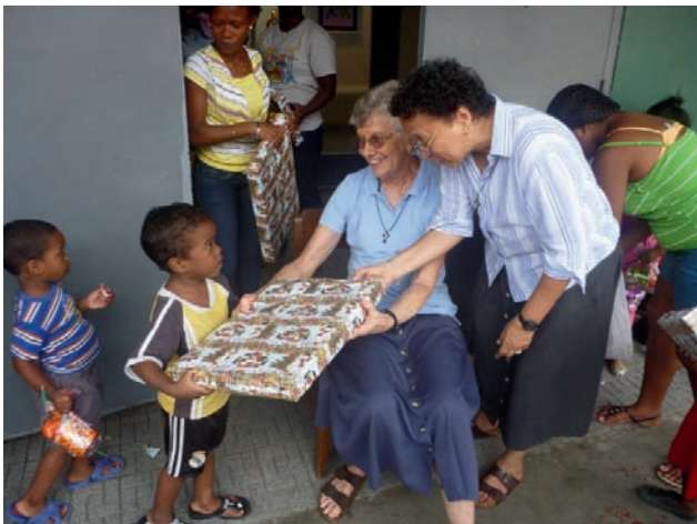
Sisters of Mercy in Panama distribute gifts to local children.