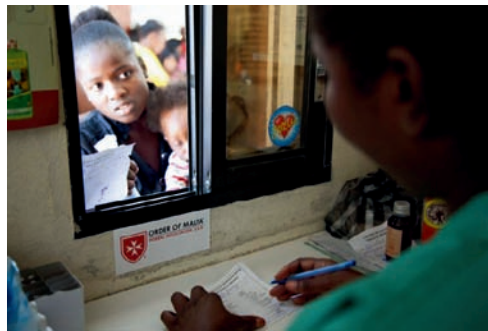
Cite Soleil, Haiti