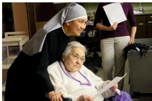
Little Sisters of the Poor - Baltimore, MD

D omestic grants totaling more than $625,000 were made to organizations serving the sick and the poor. Twenty-eight domestic grants representing over $400,000 were awarded to regions in support of significant programs in which Members of the Order of Malta are active volunteers.