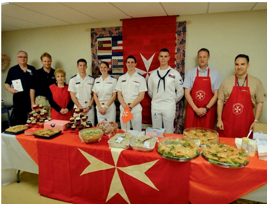
Montgomery County, MD