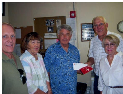
Lawrence Community Shelter - Lawrence, KS